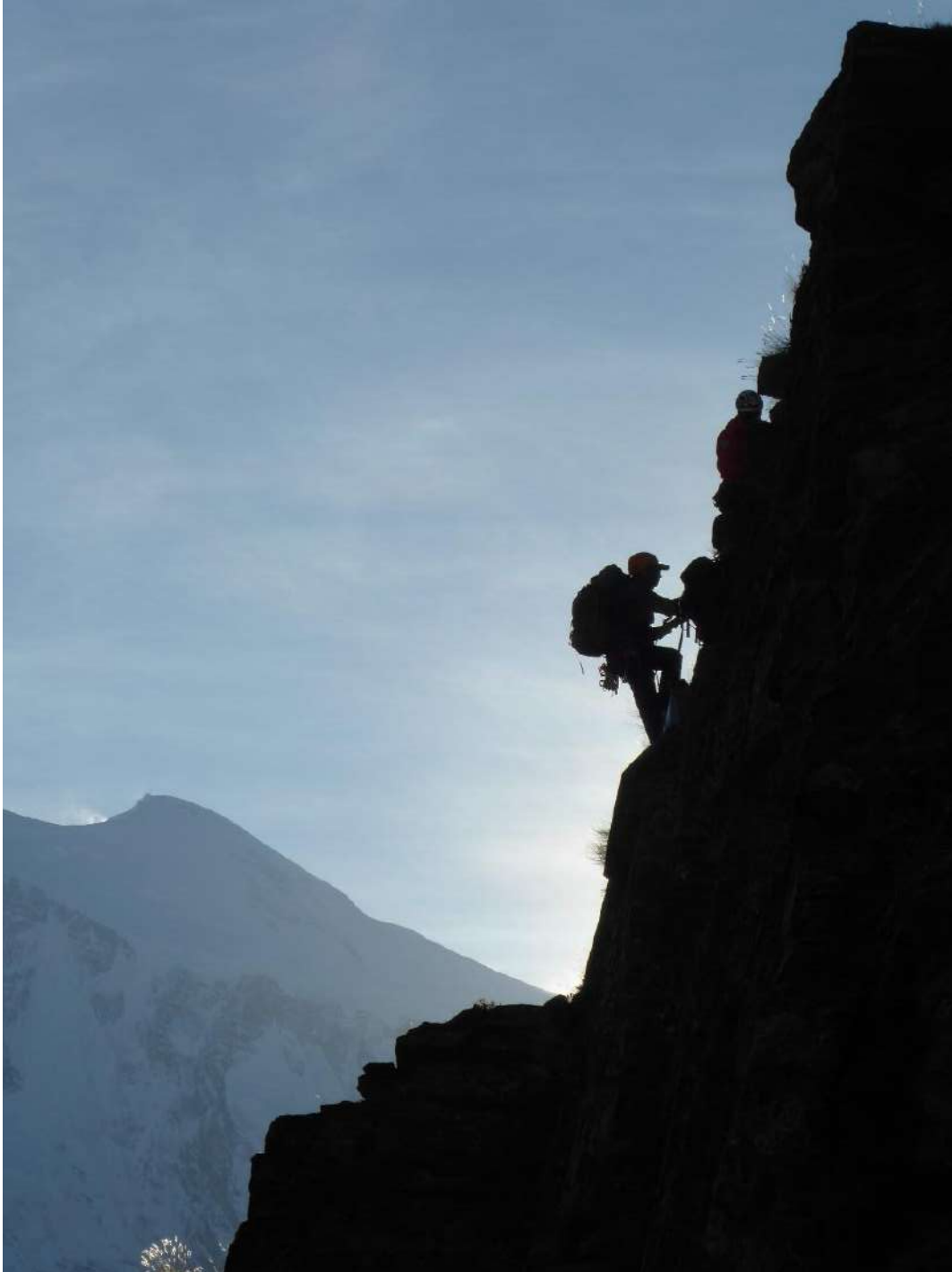
XII ISMM WORLD CONGRESS ON MOUNTAIN MEDICINE "Mountain medicine in the heart of the Himalayas"